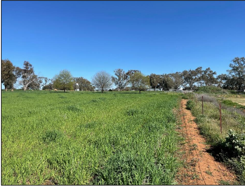
Looking west over the recommended application area